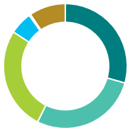
Asset allocation (%)