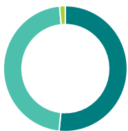
Asset allocation (%)