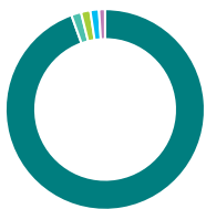
Asset allocation (%)