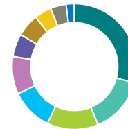
Sector allocation (%)