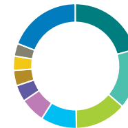
Sector allocation (%)