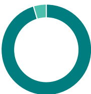
Geographic allocation (%)